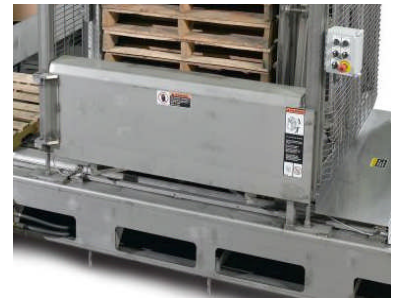
Product Infeed Clamps