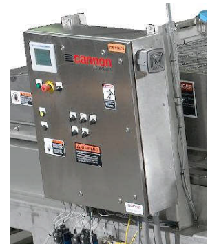
Control Panel with Optional Display

Materials and specifications are subject to change without notice